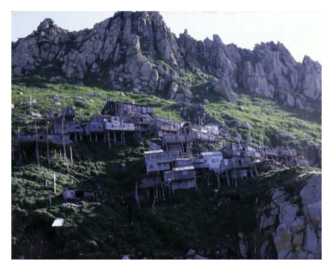
Photo 1: King Island village No photo date available.